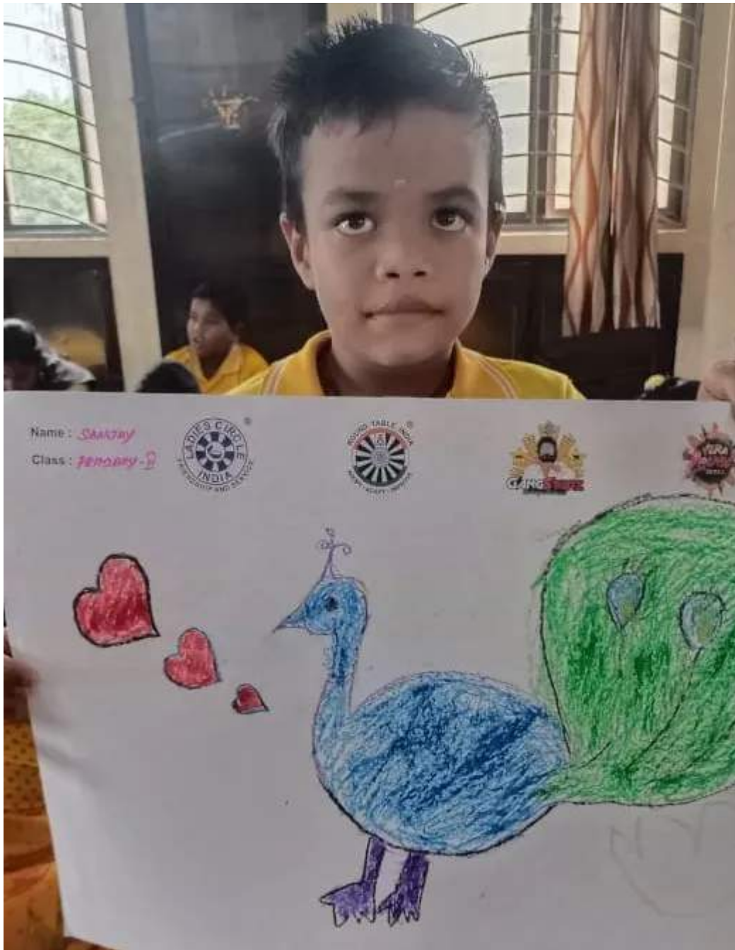
Satya Special School's Special Abilities Art Extravaganza, where young artists showcase their extraordinary talents in collaboration with Round Table India.