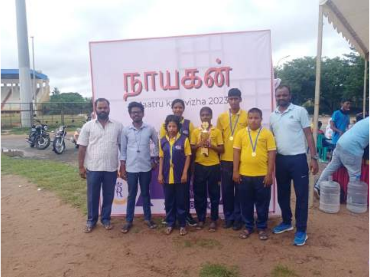
Medal winners at Nayagan Maatru Kalaivizha 2023