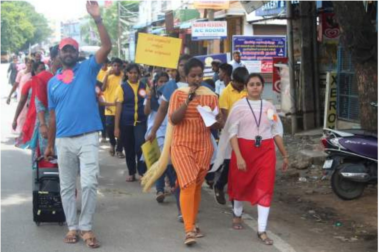
Satya Special School's Inclusive Rally, a celebration of diversity and unity on the International Day of Persons with Disabilities.